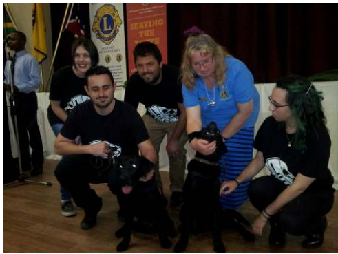
The Leos with Leo AND Melvin!

The Conference concluded with the announcement of the top three Peace Poster Winners, two of whom were present to receive their prizes. See photos under DC Peace Poster.