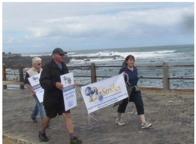
Lions and family members from Zone 1