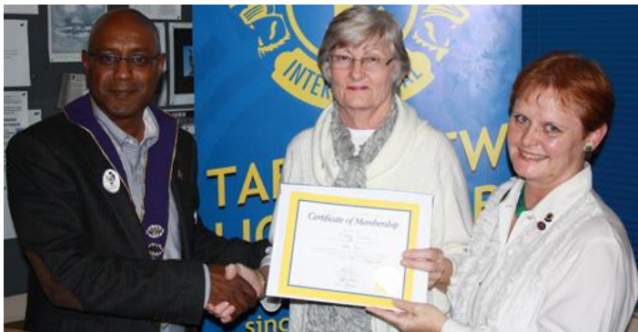
Table View Lions Club, Republic of South Africa

The Ask One Campaign is being encouraged through out the world. Just imagine if every Lion, 1.35 million , asked one person to join their club... Clubs are encouraged to submit photo's of Inductions with a short summary of what your club has done to attract new members to Lions Clubs International to: AskOne@lionsclubs.org . Thank You Lions Club Alte Feste Windhoek and Table View Lions for submitting. Hereunder an example: