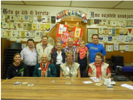
The Walvis Bay Lions still meet in the historic Rheinisch Mission Church 1879-1979 and continue to serve their community.