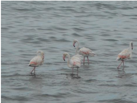
The beauty of Walvis Bay